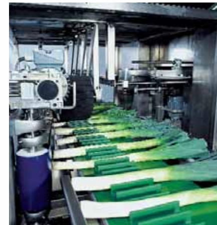
The product is adjusted variably, hold to the position by a holding-down device and cut by a special knife on the root- and leaf side of the leek.

Do you only have little space available in your packing shed? As a result of its compactness and onesided construction, the semi-automatic STRAUSS leek weighing line enables you to benefit of the little space you dispose more efficiently and space-savily.