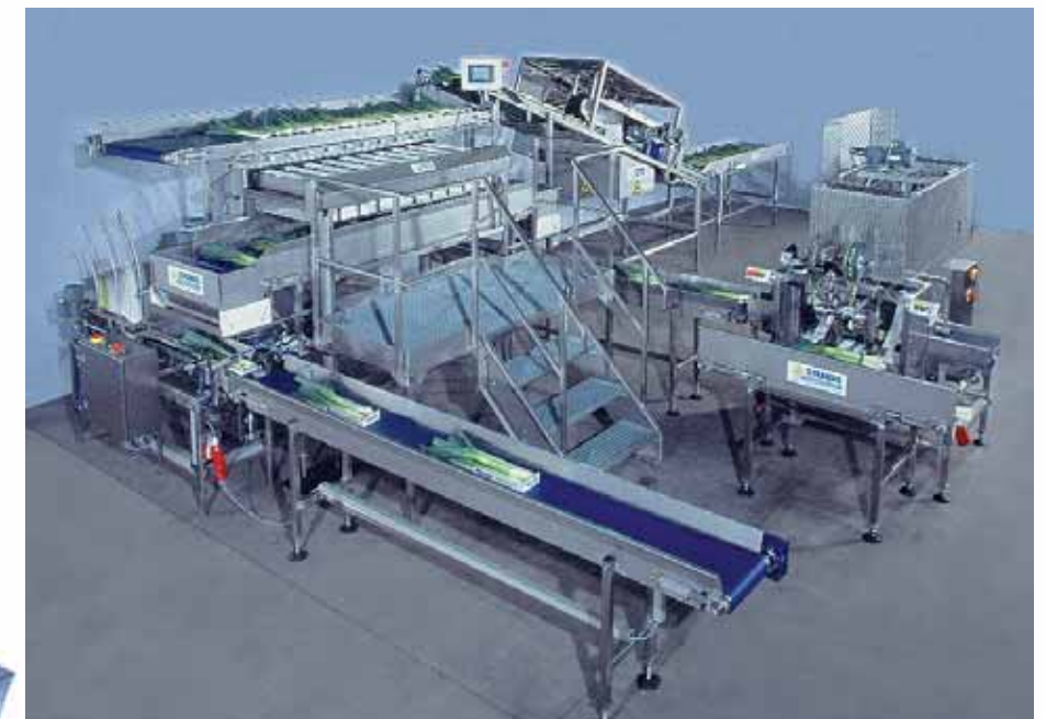
space-saving and effective, the semi-automatic STRAUSS leek weighing line