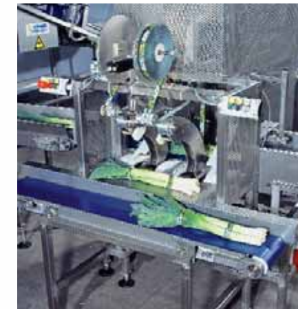
The newly designed banderoling unit bunches the weighed leek packages by means of two adhesive tapes