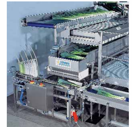
The cardboard bowls are automatically fed, erected and finally filled with the weighed leek packages by opening the magazine.